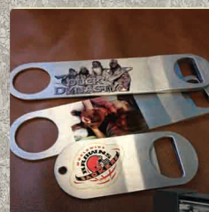
Steel Bottle Openers